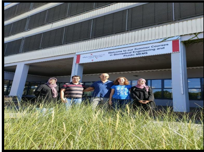
5: All the group with our professor at the end of the second week

Meanwhile, we had enjoyable activities every day after school. We visited some cities next to Wilhelmshaven like Bremen, Oldenburg as well as a beautiful Island called Heligoland. And I enjoyed playing basketball with guys and other games on the beach.