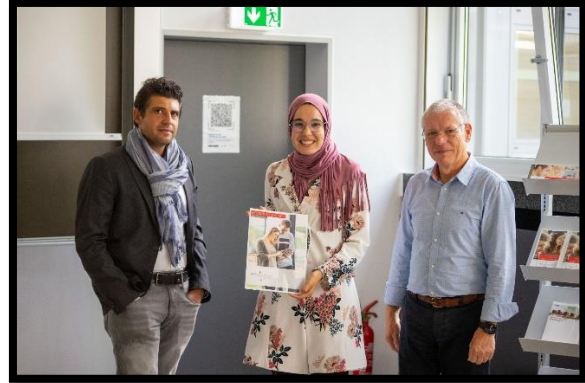
10: The final presentation