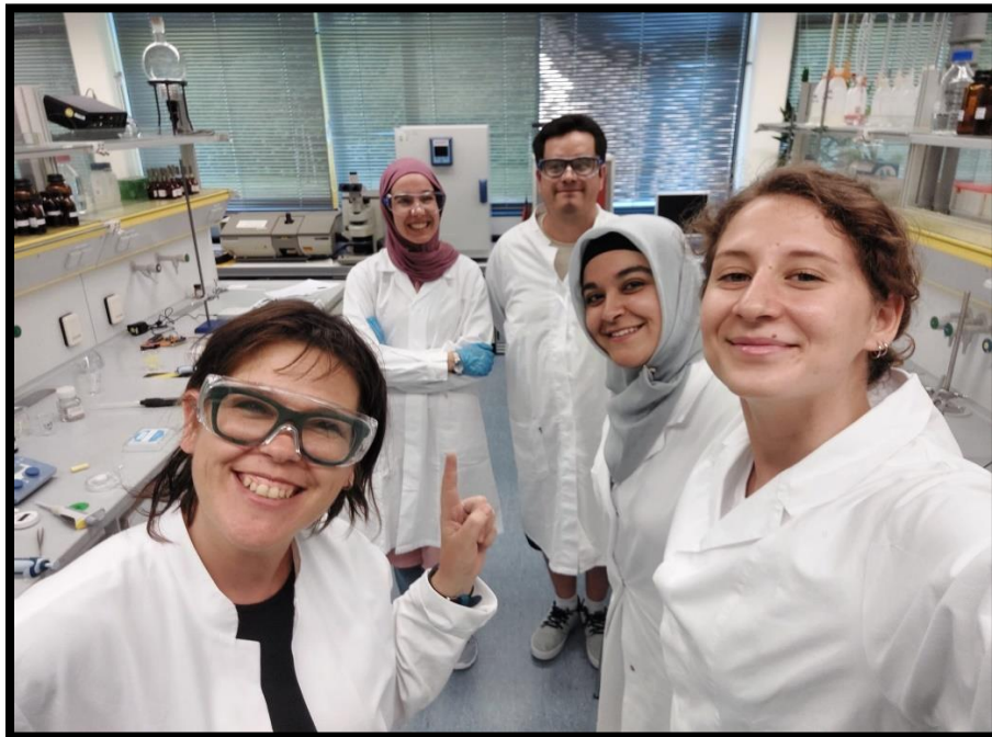
3: Photo of all the group with the professor at the end of the first week

The most important thing I learned from the first week, besides the hard skills and how to build a biosensor of glucose monitoring from scratch, was how to manage the stress and enjoy the "Feierabend" after every busy day just like Germans do!