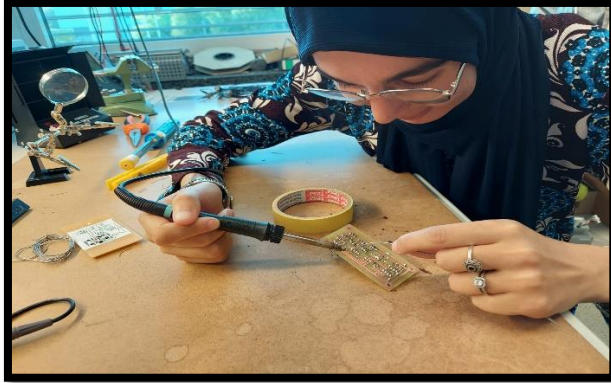
1: Preparing the PCB of Glucose biosensor