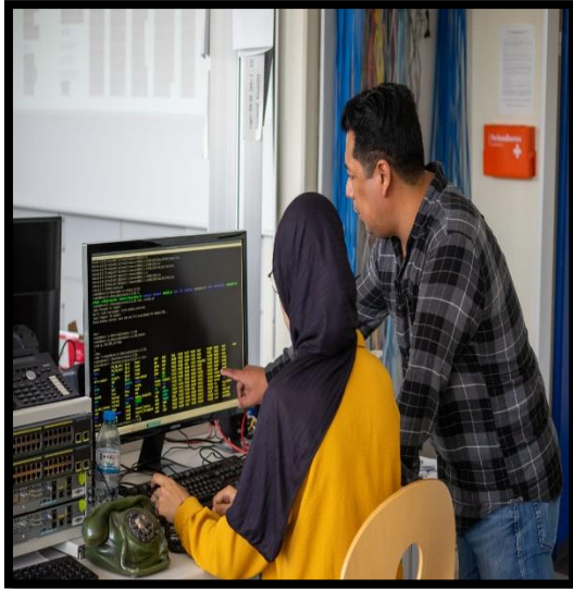
7: During the class in the third week

The third week was the last, and therefore the most precious. Knowing that the adventure is going to finish on that Friday saddened me a little, but pushed me also to enjoy every single moment of the week. We studied embedded systems and IOT for medical technology. The project of the week was about deploying a biomedical application that calculates heart rate and our Mexican professor was very friendly and helpful.