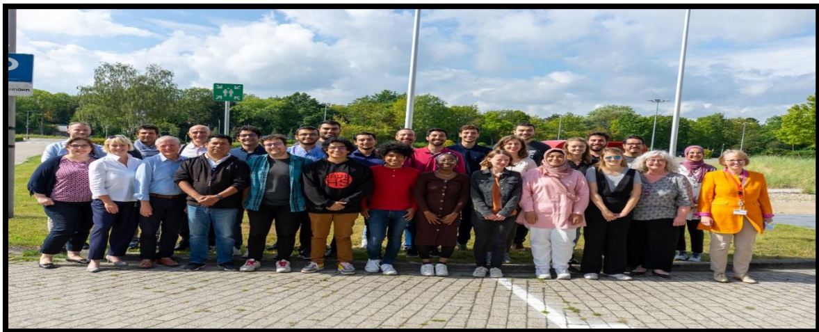
11: Photo with all the participants and the staff at the end of the course

I honestly hope to meet all these beautiful people one day again. And I believe that this won't be my last time in the amazing country of Germany!