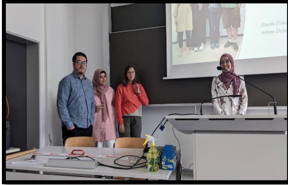
9: Obtaining my certificate