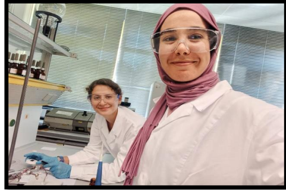
2: Testing the glucose monitoring biosensor

On Friday, however, everything went very well. We did the presentations, we took the exam and I was very satisfied and proud of what I was able to learn and how I managed to be flexible despite all the difficulties.