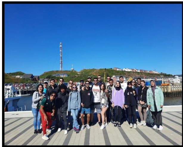
6: In Heligoland